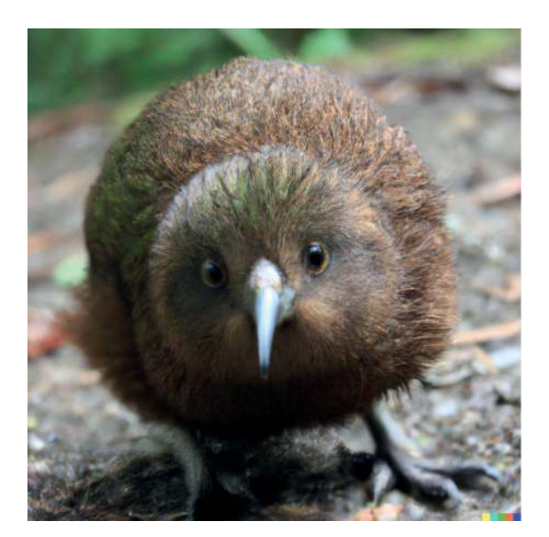
Created by DALL-E in response to the prompt, 'Can you show me a kiwi bird?' Generated on 2 March 2023.

Immediately this raised concerns amongst teachers and educators. First, AI-generated images from the likes of DALL-E and Stable Diffusion shocked people with the ability to create images at a level of quality and accuracy they had not before experienced from short descriptive prompts.